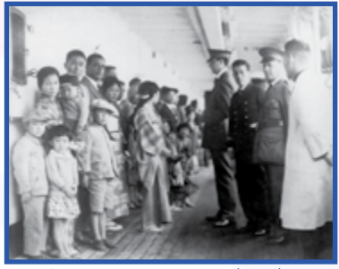
Immigrant inspection on board a ship docked at Angel Island in 1931.

Imagine an Immigration Interview," Smithsonian